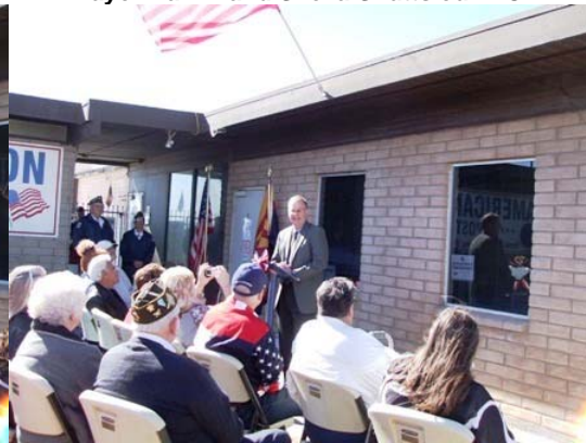
General Maxon addresses the group