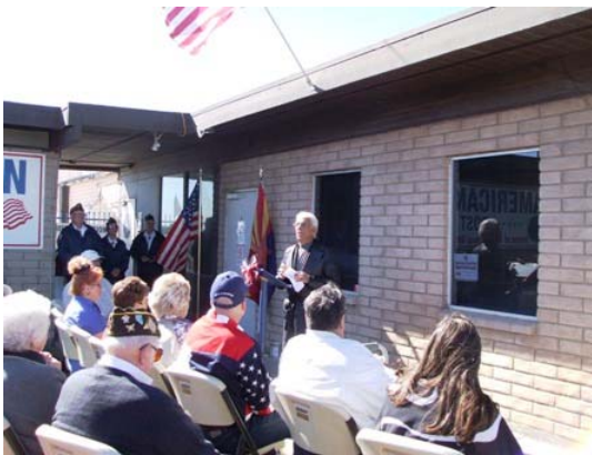
Bullhead City Mayor Jack Hakim