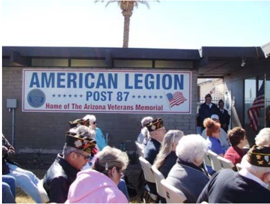
Hosted by American Legion Post 87