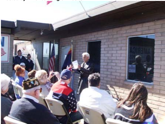
Mayor Jack Hakim Addresses the group