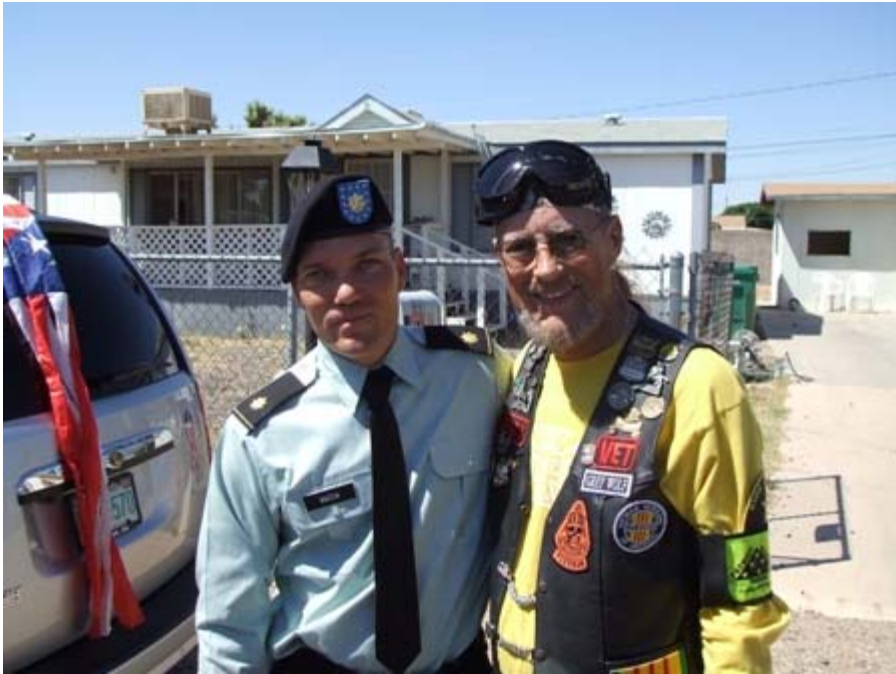
The group staged at VFW 10386 before departure