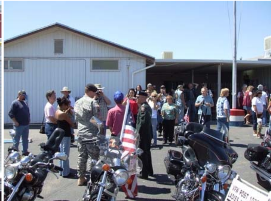
Thank you Kingman Fire!