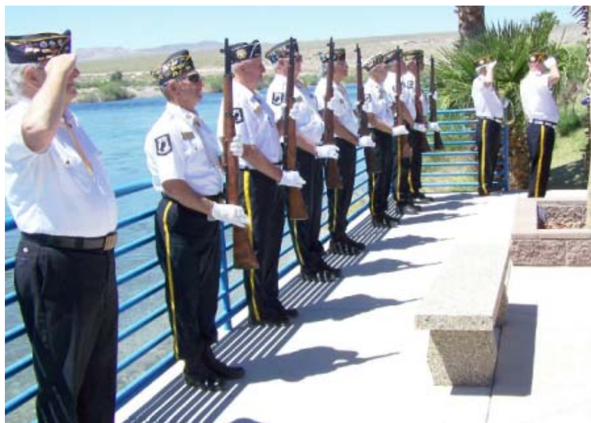
PGR Flag Line